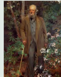
Frederick Law Olmsted by John Singer Sargent

In partnership with Louisville Metro Parks and Recreation, the Conservancy has raised nearly $30 million for park improvements, with an eye toward historic preservation, environmental protection, park user amenities and advocacy for the Olmsted Parks system.