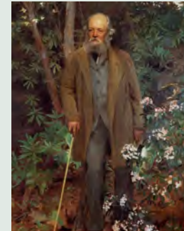
Frederick Law Olmsted by John Singer Sargent

In partnership with Louisville Metro Parks and Recreation, the Conservancy has raised nearly $30 million for park improvements, with an eye toward historic preservation, environmental protection, park user amenities and advocacy for the Olmsted Parks system.