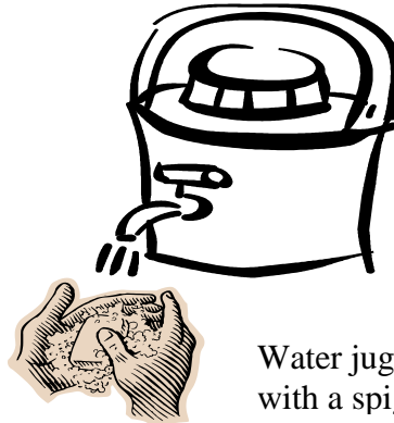
Water jug with a spigot