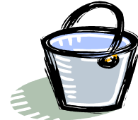
Bucket to catch dirty water