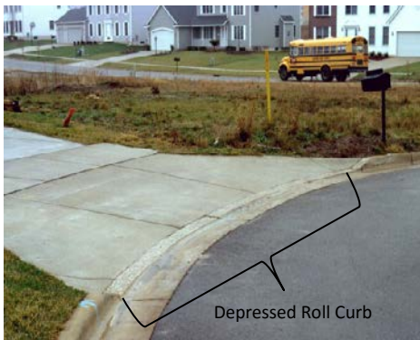
Figure 3. Depressed Roll Curb.