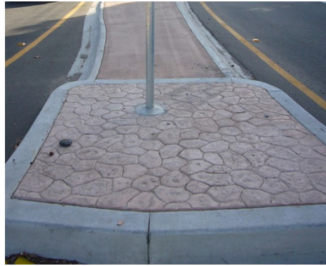
Figure 4. Median Curb.

Please refer to Louisville Metro Government's Standard Plan No 410A (2015 Edition) for specific details on curb types: