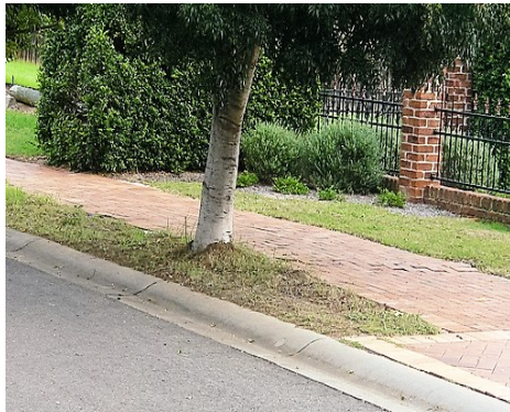
Figure 1. Standard Roll Curb.