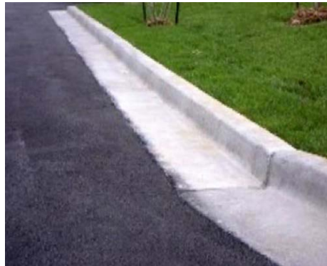
Figure 2. Vertical Curb and Gutter.