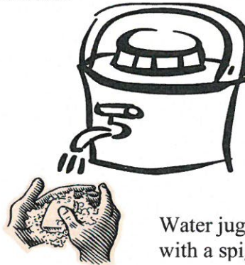
Water jug with a spigot