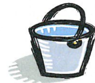
Bucket to catch dirty water